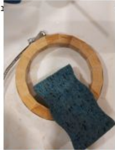
28 Wash off excess glue.jpg