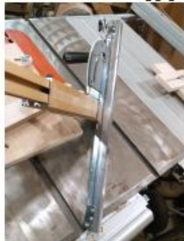
6 Adapter snapped onto miter.jpg