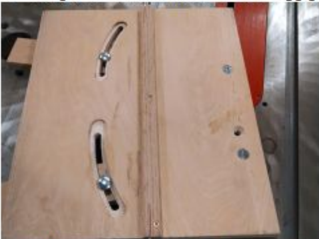
7 Bottom of sled jig - Oak