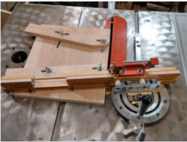
1. Setting up sled with Inkra Miter