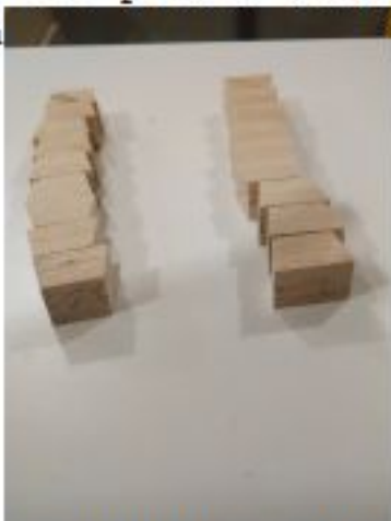
23 On Glueing table.jpg