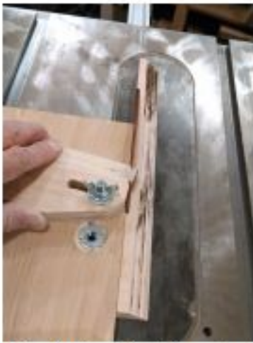
17 Cut of tip.jpg