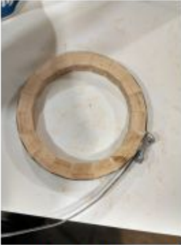
27 Clamp and arrange any out of