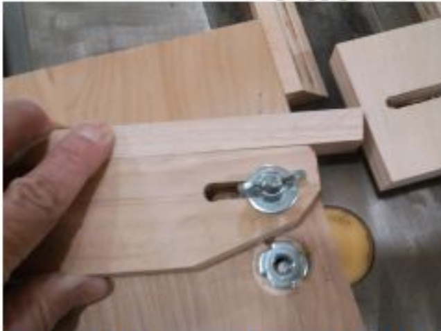
19 Switch to other rail..jpg