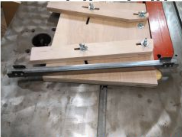
5 Adapter for Inkra Miter.jpg