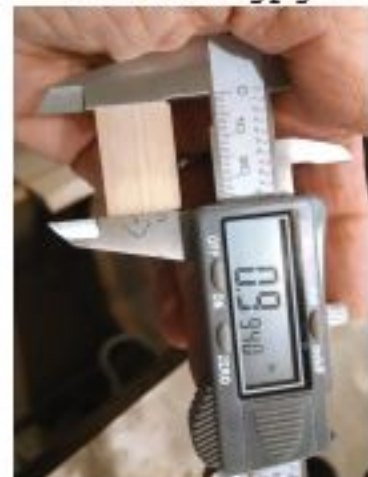
24 Mark one piece for center.jpg