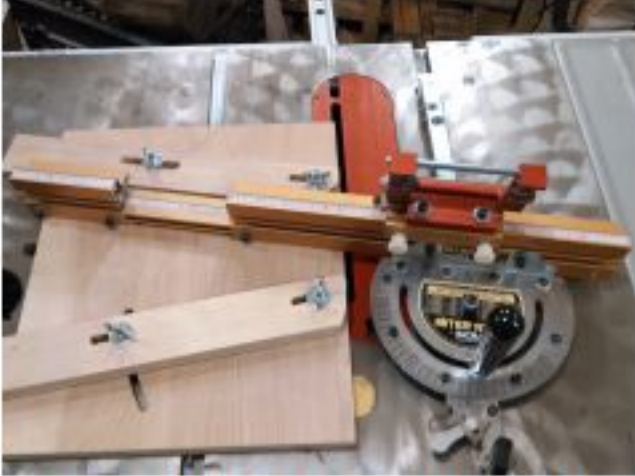
3 Setting upper angle.jpg