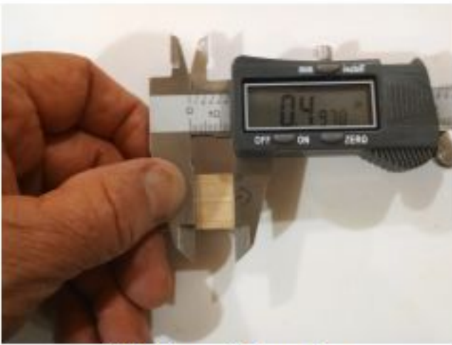
25 Draw line.jpg