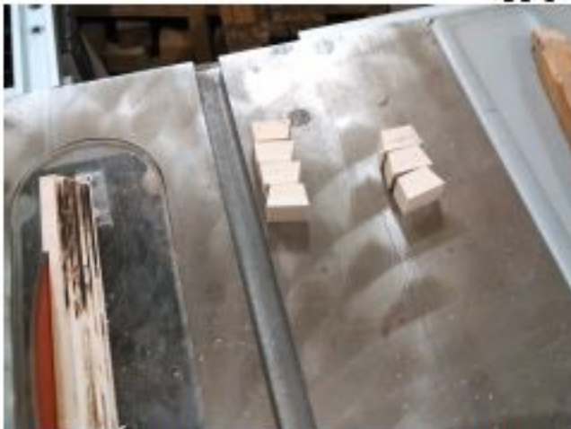
21 I keep the pieces from each rail sepa .jpg