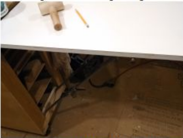
29 My glue table.jpg