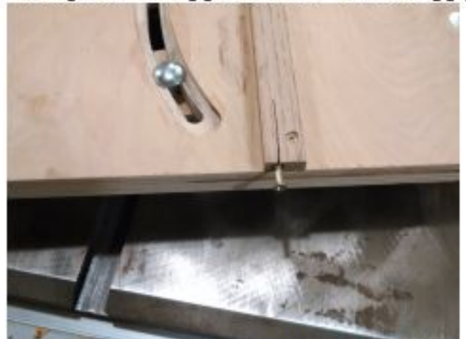
8 Adjustment screw slot.jpg