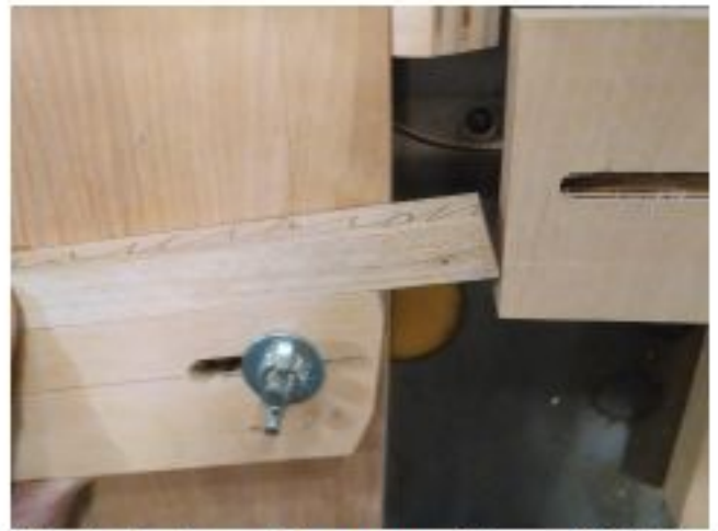
18 Switch to other rail - Slide to