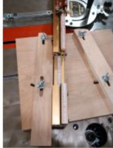
4 Side view.jpg