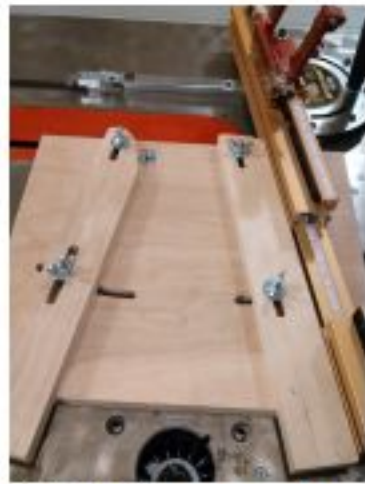
2 Side view.jpg