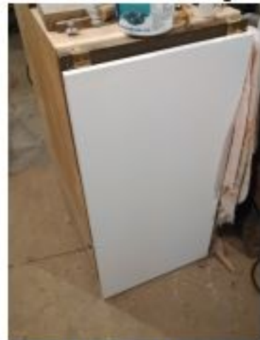
30 Folds down.jpg